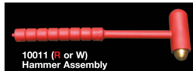
10011 (R or W) Hammer Assembly