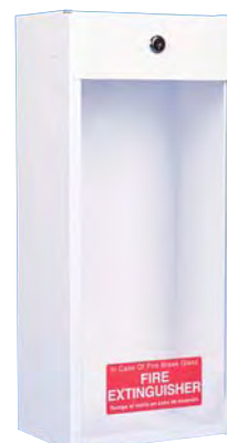
Classic Series White