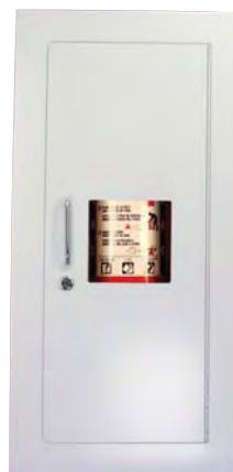
Center Duo (style 9) ELITE Series