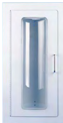
Bubble Canopy (BC)