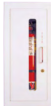
Vertical Duo (style 8) ELITE Series