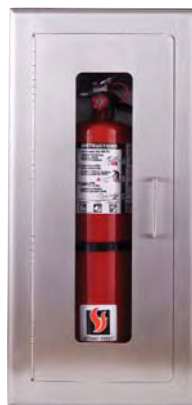
Full Glass (style 6) ELITE Series