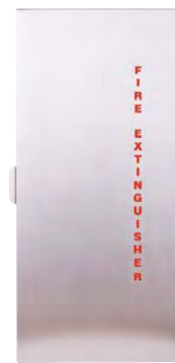
Full Metal (style 7) SONOMA Series