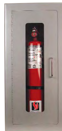
Aluminum Full Glass (style 6) TITAN Series