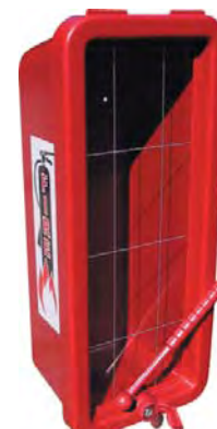
Plastic Cabinet Red or White