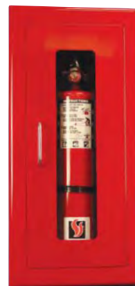
Red Coat Option ELITE Series