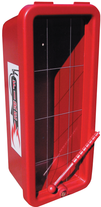
Cylinder lock/2 keys and hammer included