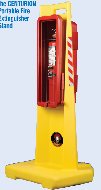
(extinguisher sold separately)

the CENTURION Portable Fire Extinguisher Stand