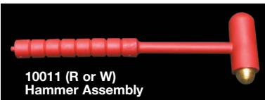
10011 (R or W) Hammer Assembly