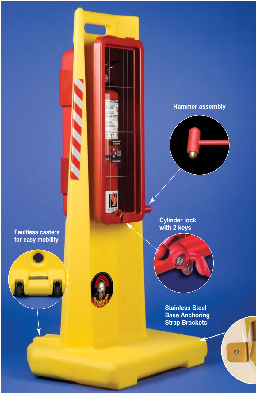
(Extinguisher not included)