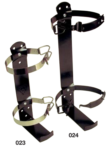
023 Double Strap 024 Double Strap